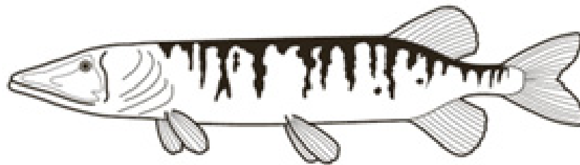
Figure 1. The fish.