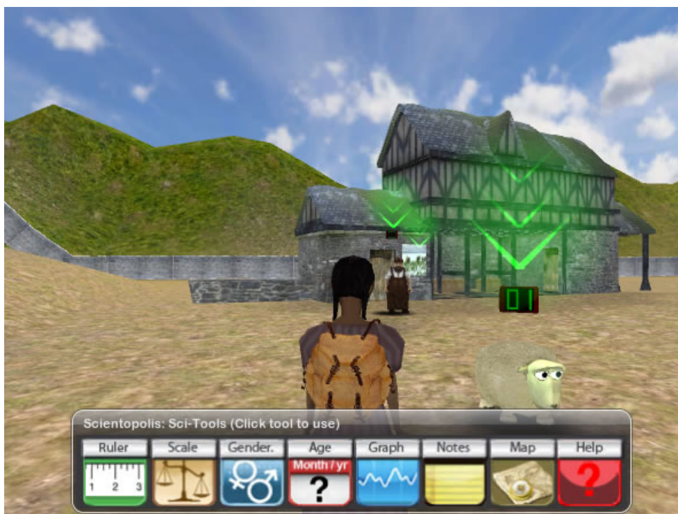
Figure 2. Scientopolis: the SAVE Science world.