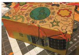
Solar panels taped to back of box to be placed against window