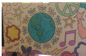
Girls' colored design of the shoe box

In this way, both students and teachers had access to new discourses for naming some of the classroom community inequities they could address as well as what knowledge mattered in engineering design. The two girls in the Make-a-Friend group shared similar sentiments, noting that once they had gone all around the school to get ideas and suggestions for their board in “so many languages” they “had to get it to work!” This was not easy for this group. The girls originally had imagined many LED lights around their board but settled for two lights just to make sure that their board worked. This incorporation of community language and discourse into engineering design further helped to position the students with the authority, in collaboration