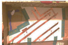
Circuitry inside box lid