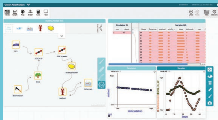
Figure 2. SageModeler embedded in CODAP allows for data analysis even when using semi-quantitative values and functions. Notice where the graph axes are “low” to “high” and how the table uses bars to represent relative values.

better understand a system and improve their models. To facilitate iterative development based on data analysis, SageModeler is embedded in CODAP, the Common Online Data Analysis Platform (Figure 2). CODAP is an intuitive graphing and data analysis platform that takes the outputs from the systems models, as well as any other data source—published data sets, such as ocean temperatures or CO 2 emissions, results of computational models like Next-Generation Molecular Workbench or Net-Logo, or data from sensors—and combines them into a single analytic environment.