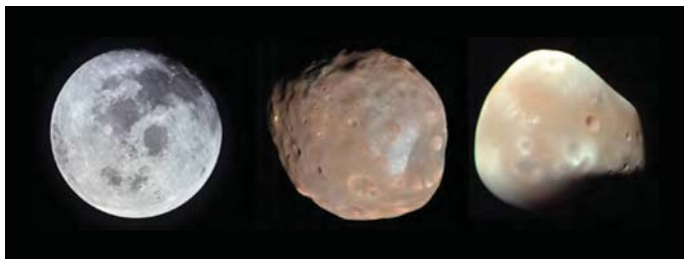
Figure 1. Images of Earth's Moon (left) and Mars's moons Phobos (center) and Deimos (right). Not to scale. The photos of Phobos and Deimos are color-enhanced.